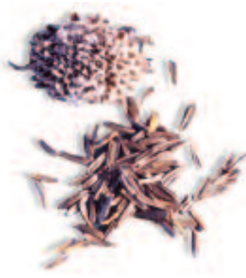
Figure 3. Balsamorhiza sagittata seed heads and cleaned seeds.

Our research objectives were influenced by the difficulties inherent with propagating and cultivating arrow-leaved balsamroot. First, this species has low seed viability (Young and Evans 1979). Furthermore, preliminary trials by Young and Evans (1979) determined that freshly matured seeds are dormant, and this dormancy is not broken in dry storage. Kitchen and Monsen (1996) concluded that seed dormancy in this species prevents summer or fall germination. Experiments aimed at finding methods to enhance seed germination and to find optimal conditions for breaking dormancy. Second, arrow-leaved balsamroot is adapted to arid growing conditions, therefore, we wanted to determine if seedlings would survive in a greenhouse environment (usually humid), which often leads to accelerated plant development.